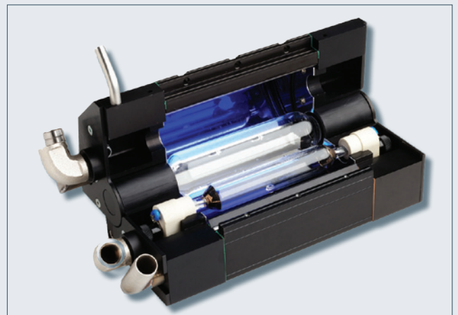
DropCure™ – easy access for lamp change

BALDWIN – complete printing periphery in one system