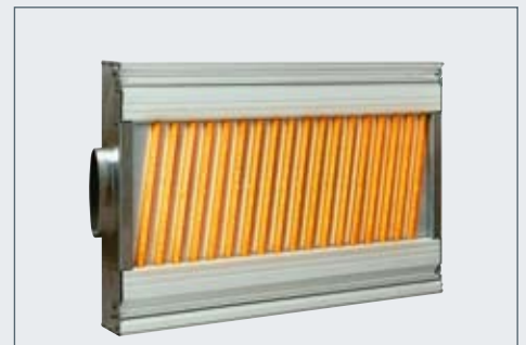
All 18 lamps turned on