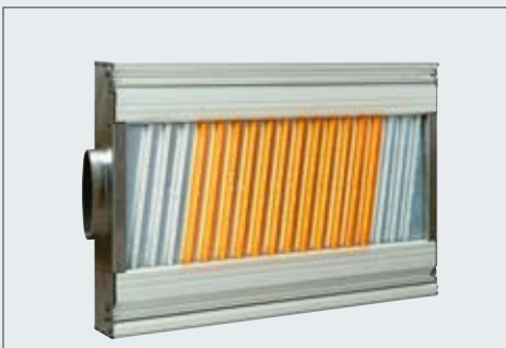
12 lamps turned on