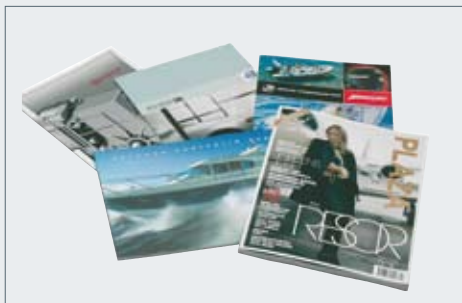
Samples of coated commercial work