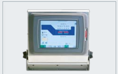
Touch screen or press integrated controls