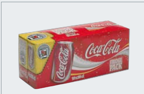
Sample of coated packaging

BALDWIN – complete printing periphery in one system