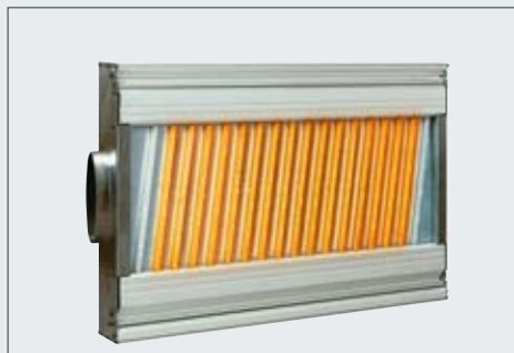
16 lamps turned on