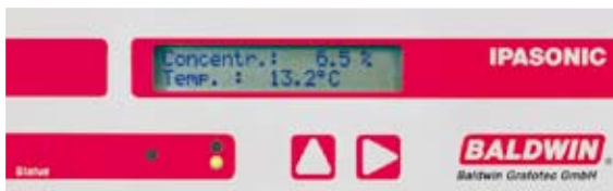
Digital display of currently measured alcohol and temperature values on BALDWIN desk units

This innovative 2-propanol measuring process has already established a good name for itself and proven reliability in practice in the food processing industry with brewing manufacturers.