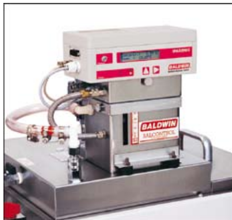
IpaSonic – installed on a BALDWIN desk unit