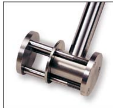
Measuring head of the ultrasonic measuring system