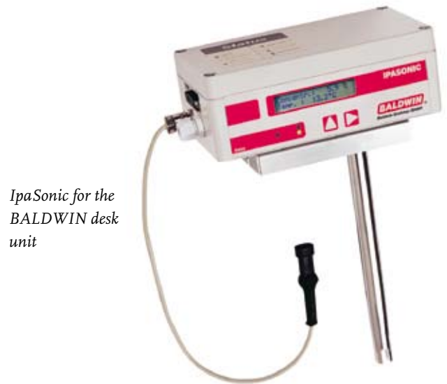
IpaSonic for the BALDWIN desk unit