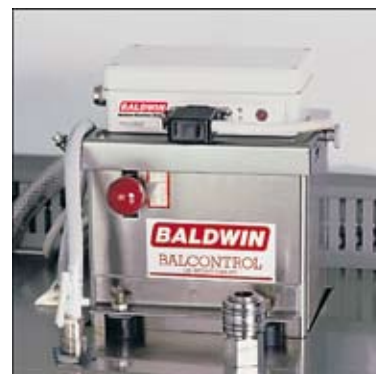
IpaSonic for the BALDWIN upright cabinet unit